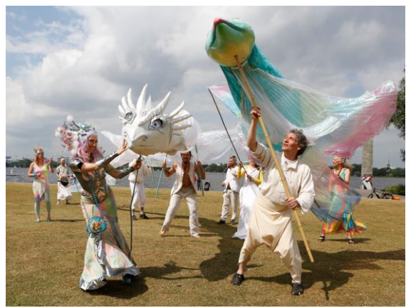
Performance Alster Hamburg

A group of German artists, actors, musicians, dancers, instrument-makers and painters are going on a quest regarding new and ancient dragon pathways to explore the elements of self, earth-water-fire-air. Bali is the destination and the goal is a cultural artist exchange with Balinese artists. It will be an exploratory expedition with an artistic and social focus. Free dance and world music, German and Balinese poetry, puppet shows and painting combining traditional and modern life are the artistic resources with which we celebrate, create, explore, design and reinvent life as a total work of art. Shows are planned in theatres and other cultural meeting points, as well as workshops for kids in social facilities and public places. We have clustered the multilateral cultural interest and artistic professions as well as the social commitment of the artists to this project: EARTH LIKE HEAVEN/ BUMI SEPERTI SURGA / HIMMEL WIE ERDE.