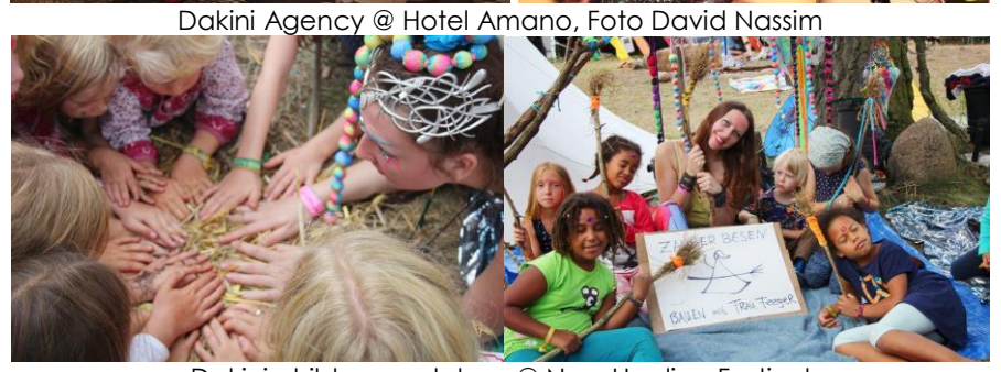
Dakini children workshop @ New Healing Festival