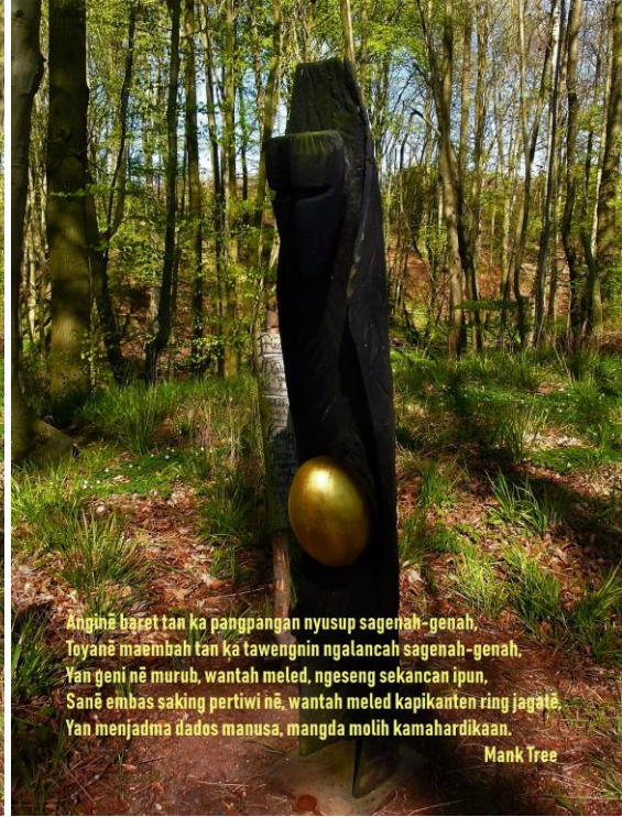
Balinese translation by Mank Tree