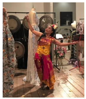
Performance in Düsseldorf