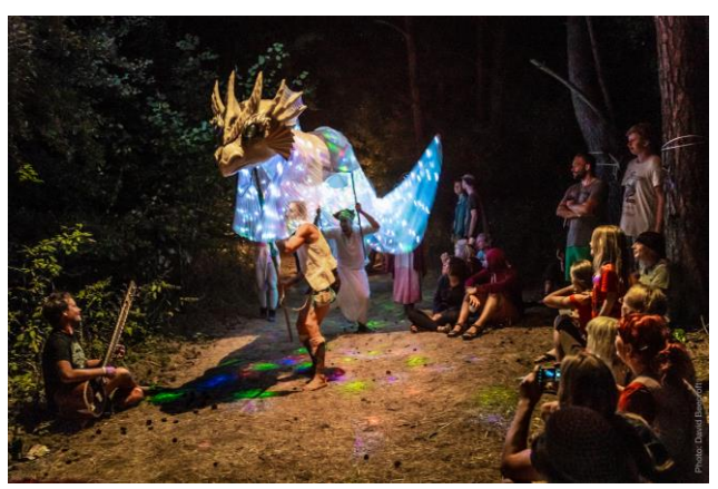
New Healing Festival